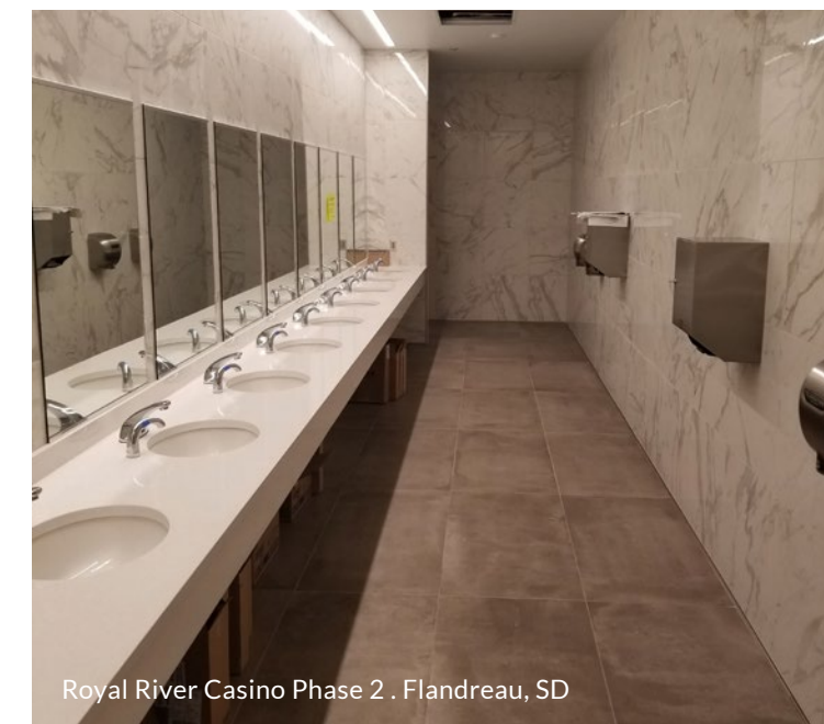
Royal River Casino Phase 2 . Flandreau, SD