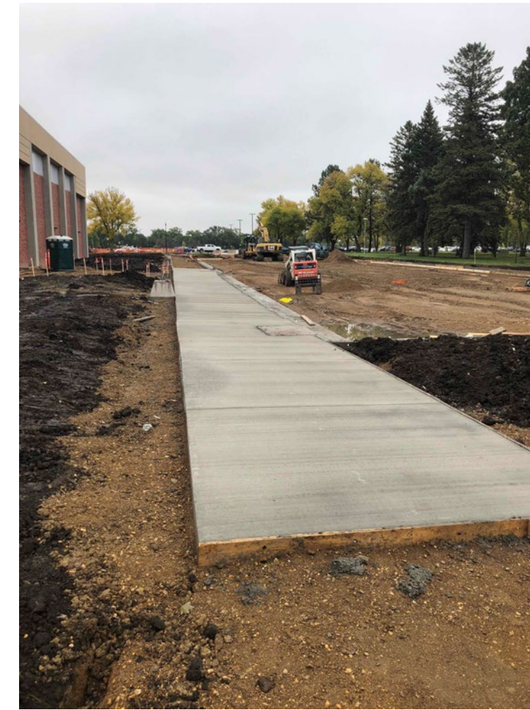
SDSU Stanley J. Marshall Center: SJM is nearing completion, with a completion date of October 29th. The crew had everything painted by October 8th and then two finish coats on top. Commissioning will begin on October 8th. We will have a two week flush out period and this is when the final touches take place. On the exterior, site concrete is ongoing and landscaping has begun. Black dirt has been placed as well and we are waiting for some trees to be placed in the coming weeks.