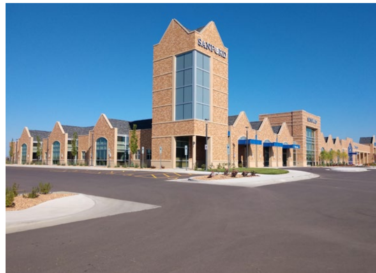
Sanford 32nd and Ellis Clinic and Lewis Drug: The Sanford 32nd and Lewis Drug project wrapped up in September. Lewis Drug opened on September 19th. The Sanford Clinic will not begin seeing patients until December 3rd after the road construction on the Tea Ellis Road completes.