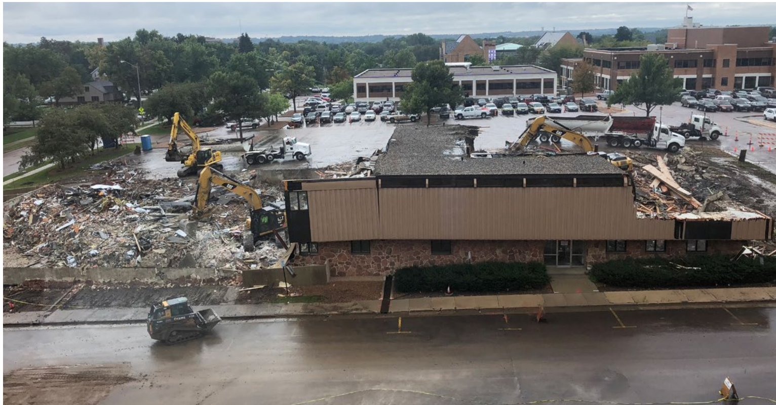
ICYMI: Medical Building 1 also known as MB1 has been torn down by Soukup Construction to create a parking lot. This really changes the look of the Sanford campus and will make room for much-needed parking!