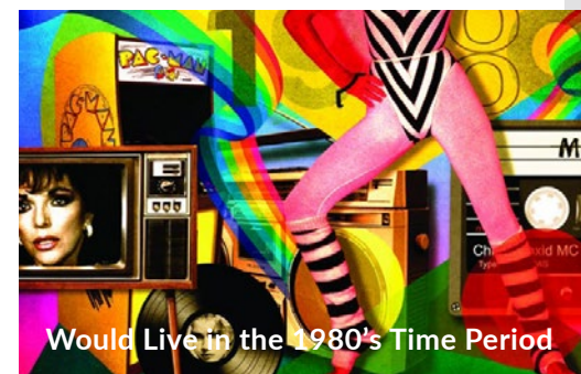
Would Live in the 1980's Time Period