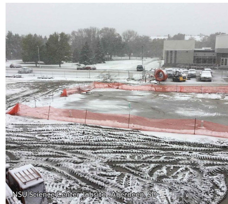
NSU Science Center Jobsite . Aberdeen, SD