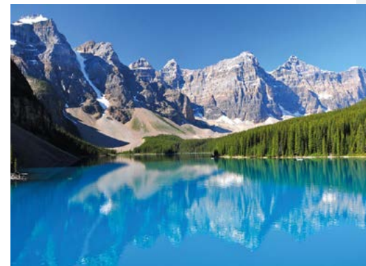
Best Vacation: Alaska