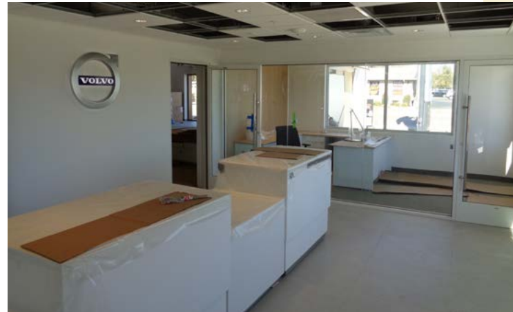
Graham Volvo Dealership Renovation - Sioux Falls, SD