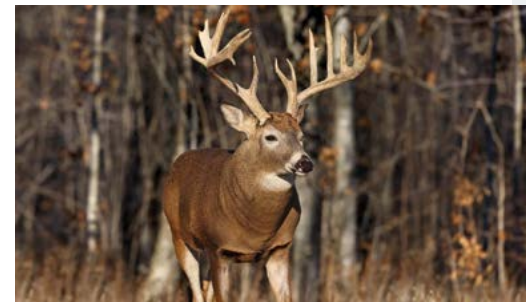
Perfect Day: Deer Hunting, Pool and Ice Fishing

The Flandreau Santee Sioux Tribal Health Center is an ambulatory facility of the Indian Health Service (IHS). The facility is diverse in the fact that it offers Medical, Vision and Dental Services to the local tribal community.