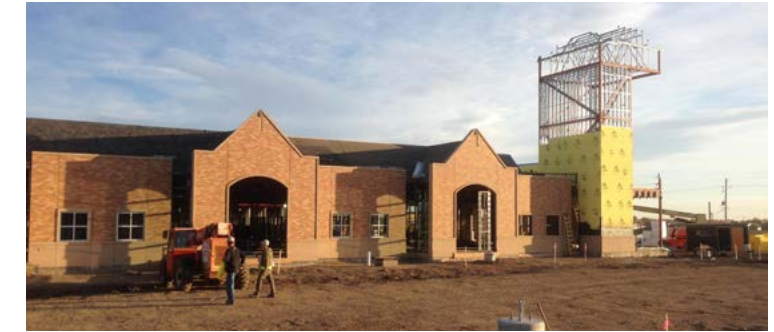
Sanford Health West Side Clinic and Lewis Drug - Sioux Falls, SD