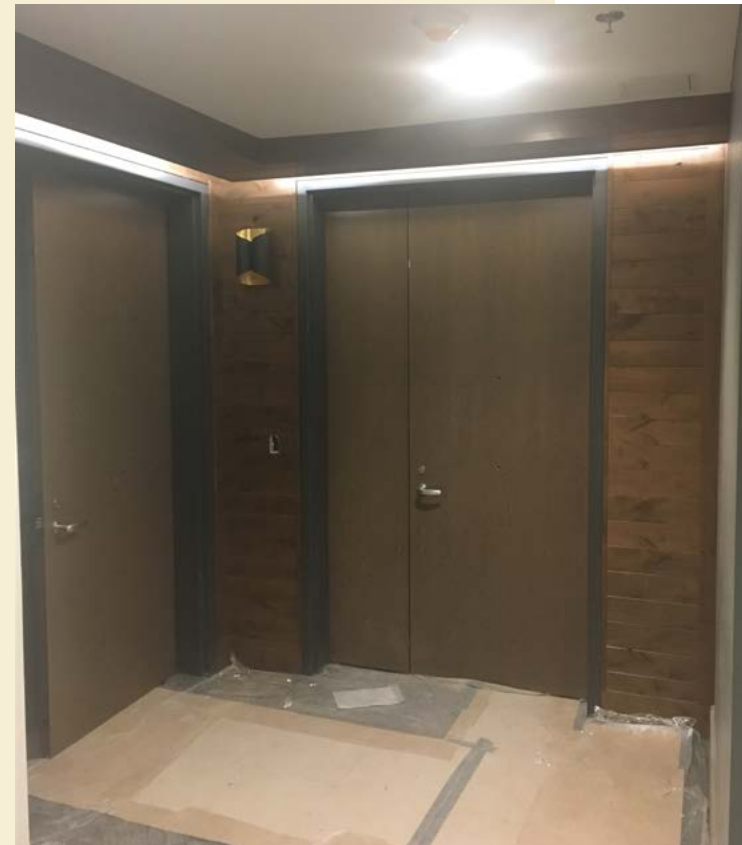
Washington Square - Sioux Falls, SD