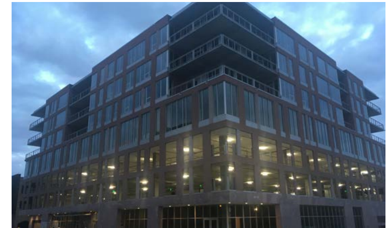
Washington Square - Sioux Falls, SD