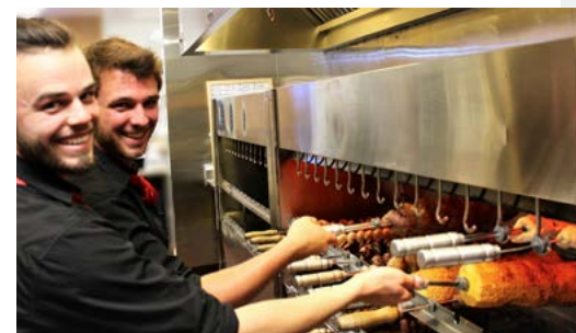
Favorite Local Restaurant: Carnival Brazilian Grill