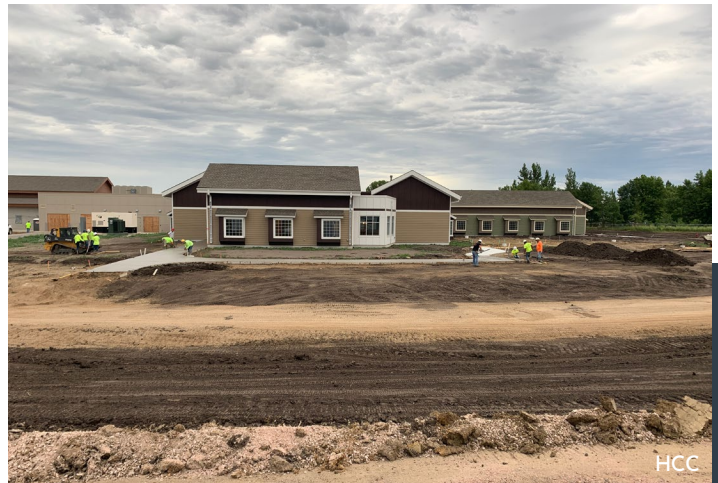
Flandreau Santee Sioux Tribe Care Center