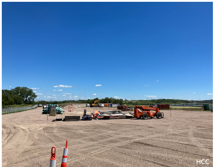
SFWRF Expansion Laydown Yard