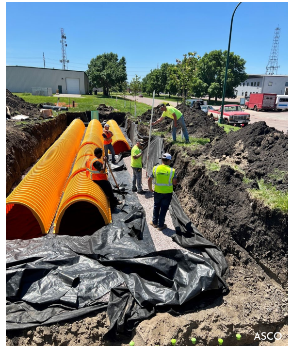
Underground Storm Water at Thunder Road