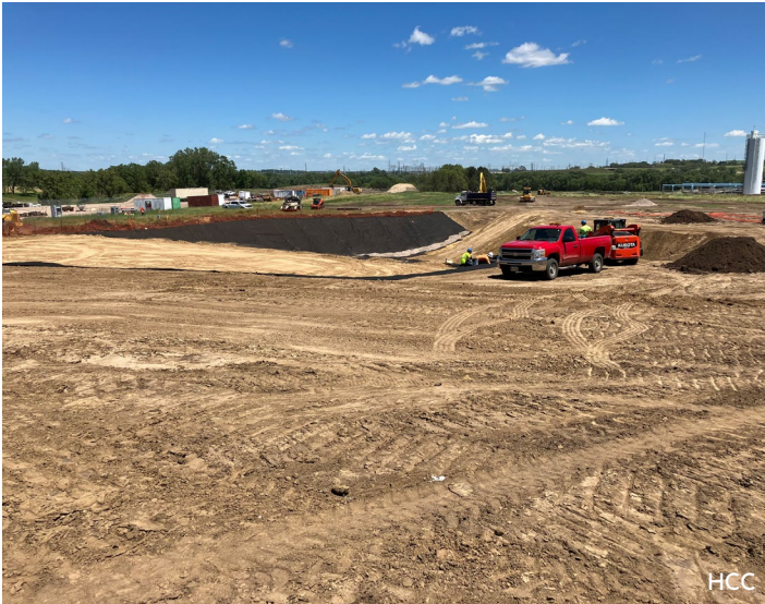
SFWRF Expansion Headworks Excavation