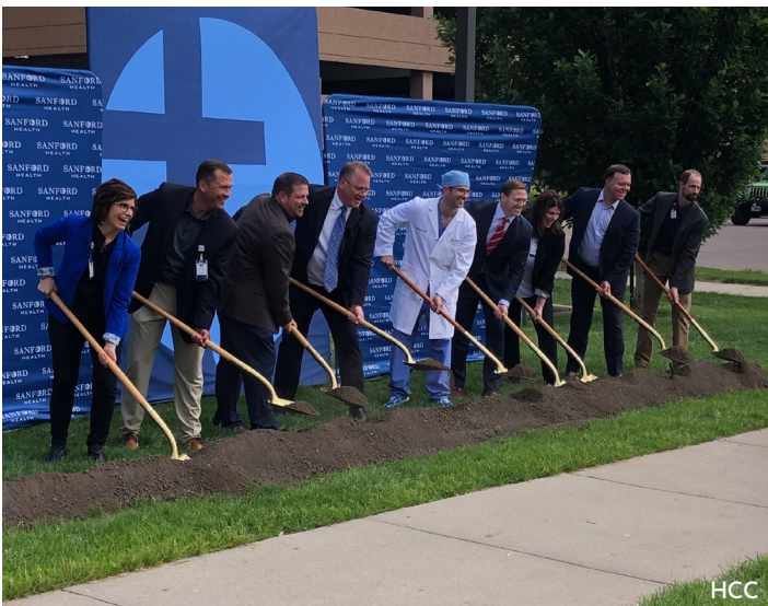
Sanford Health Van Demark Expansion