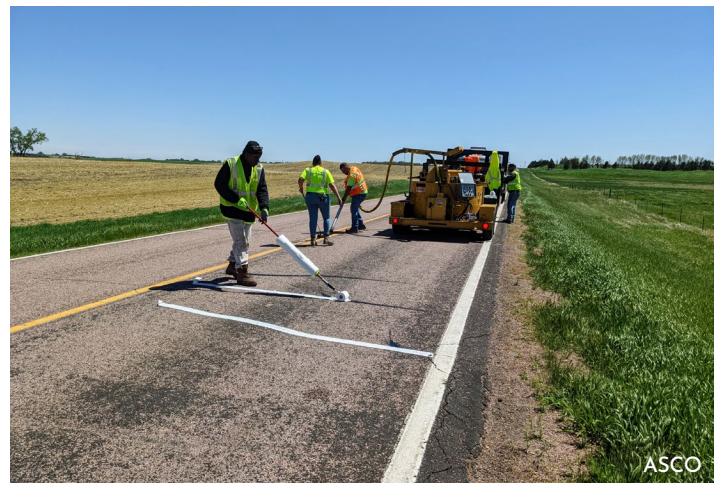
Crack Seal on Hwy. 159