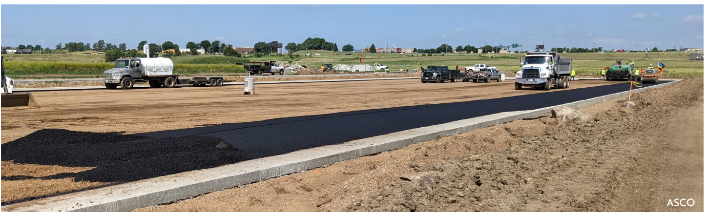
Sanford Sports Complex