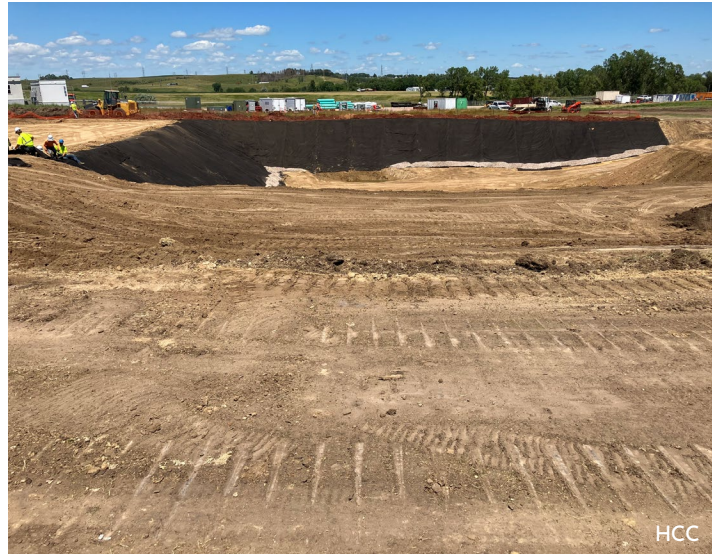
SFWRF Expansion Headworks Excavation