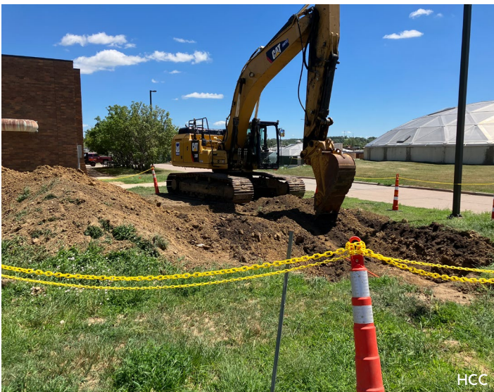
SFWRF Expansion Utility Excavation