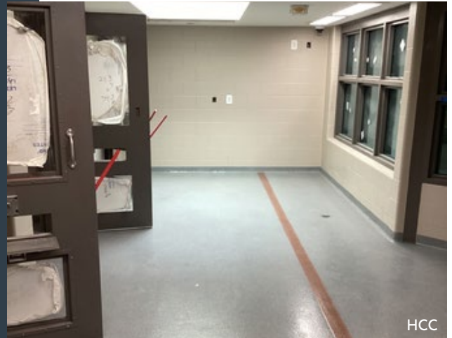
Brookings Co. Day Room

South Dakota State Penitentiary West Gate