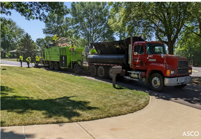
Slurry Seal at Pine Lake Hills Addition