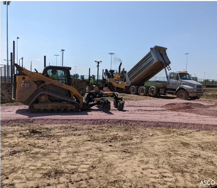
Sanford Sports Complex