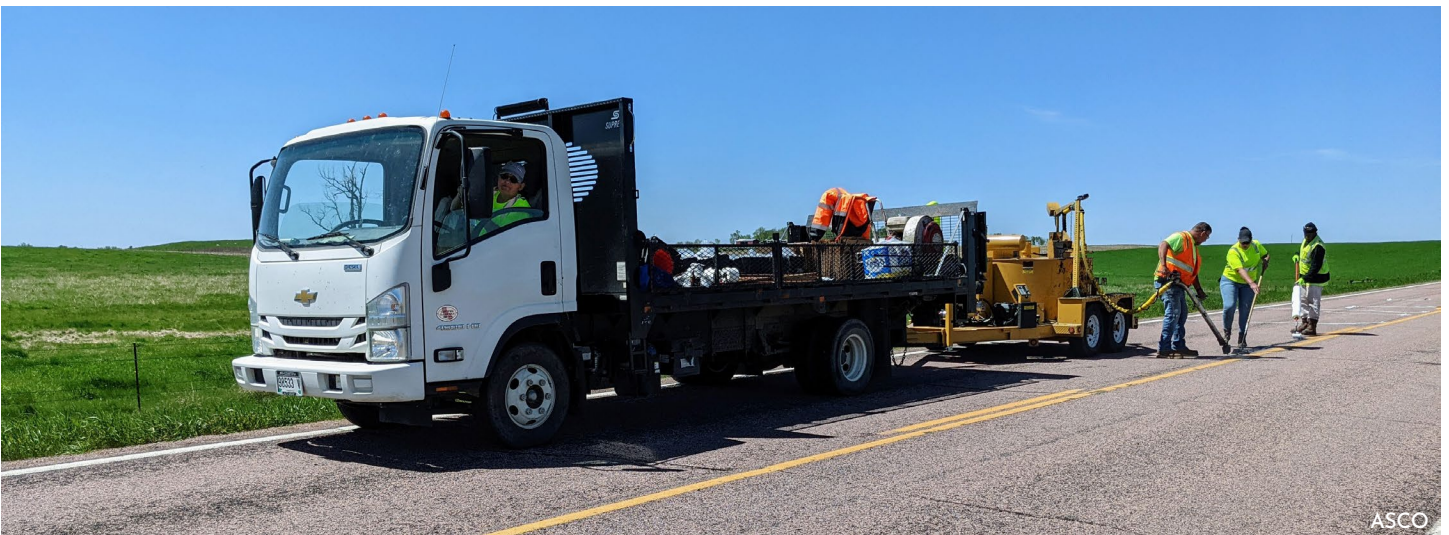
Crack Seal on Hwy. 159