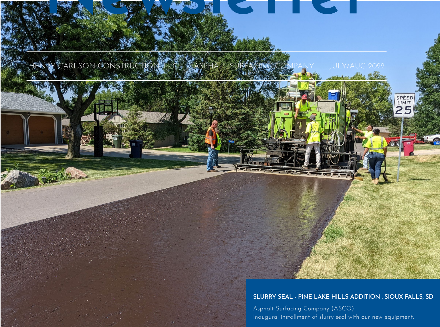
SLURRY SEAL - PINE LAKE HILLS ADDITION . SIOUX FALLS, SD Asphalt Surfacing Company (ASCO) Inaugural installment of slurry seal with our new equipment.

HENRY CARLSON CONSTRUCTION, LLC / ASPHALT SURFACING COMPANY JULY/AUG 2022