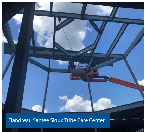
Flandreau Santee Sioux Tribe Care Center