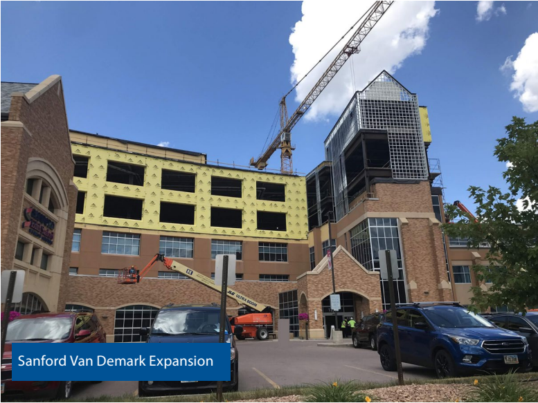
Sanford Van Demark Expansion