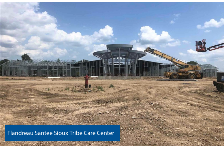
Flandreau Santee Sioux Tribe Care Center