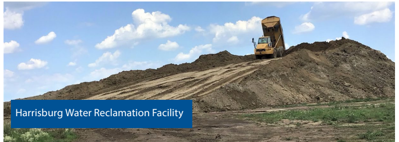
Harrisburg Water Reclamation Facility