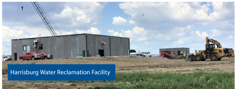
Harrisburg Water Reclamation Facility