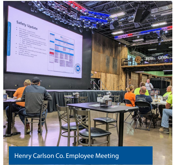
Henry Carlson Co. Employee Meeting