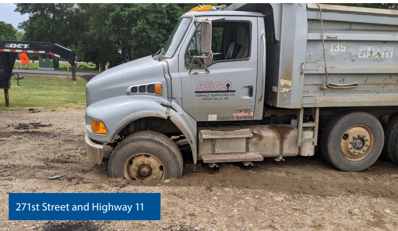
271st Street and Highway 11