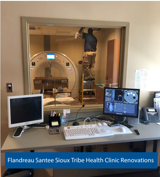
Flandreau Santee Sioux Tribe Health Clinic Renovations