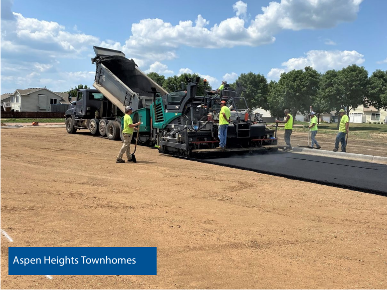
Aspen Heights Townhomes