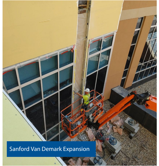
Sanford Van Demark Expansion