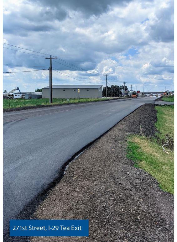
271st Street, I-29 Tea Exit