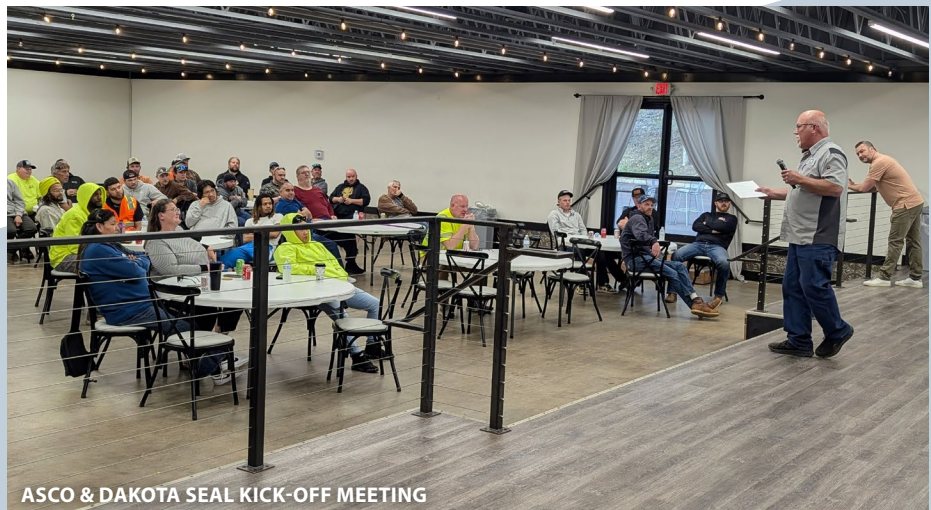
ASCO & DAKOTA SEAL KICK-OFF MEETING