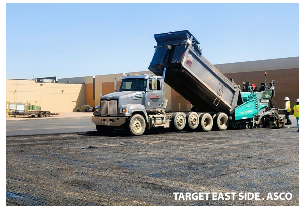
TARGET EAST SIDE . ASCO