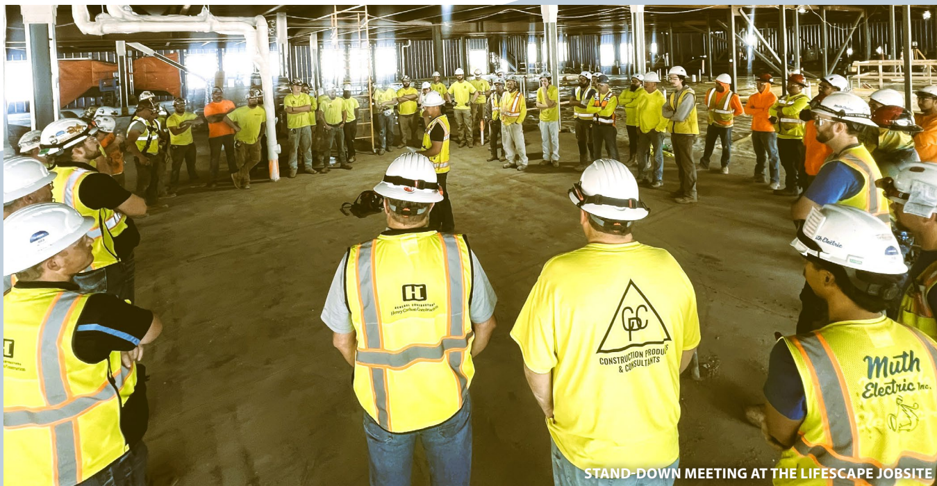
STAND-DOWN MEETING AT THE LIFESCAPE JOBSITE