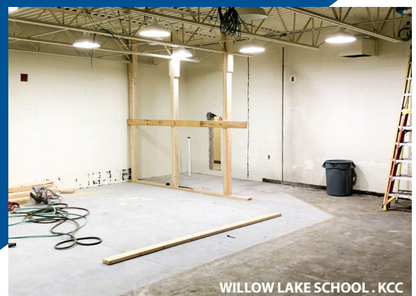
WILLOW LAKE SCHOOL . KCC

Willow Lake School: Phase 2 remodel work is complete. Work for Phase 3 in the Music Room has officially begun. Additional Phase 3 areas will kick off later this month once students are dismissed for summer break.