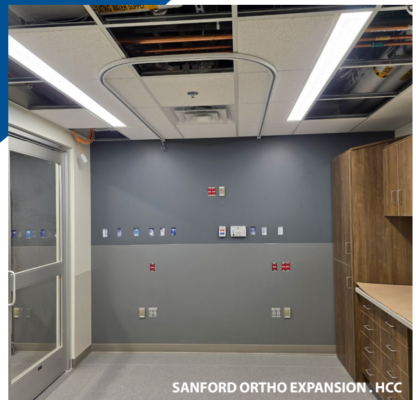
SANFORD ORTHO EXPANSION . HCC