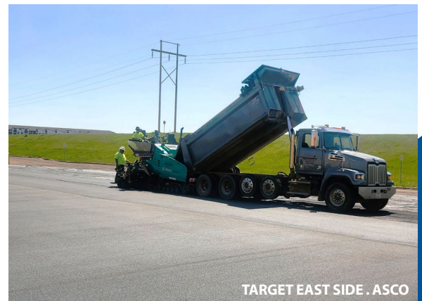
TARGET EAST SIDE . ASCO