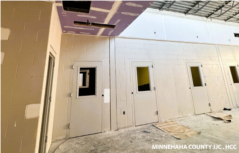
MINNEHAHA COUNTY JJC . HCC