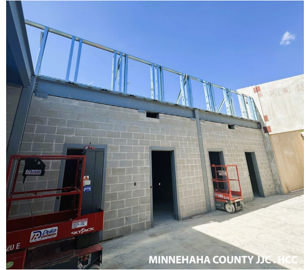
MINNEHAHA COUNTY JJC . HCC