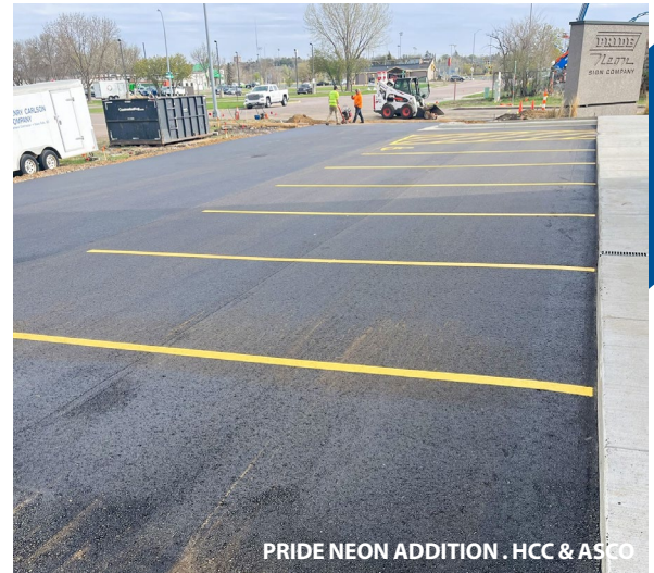
PRIDE NEON ADDITION . HCC & ASCO