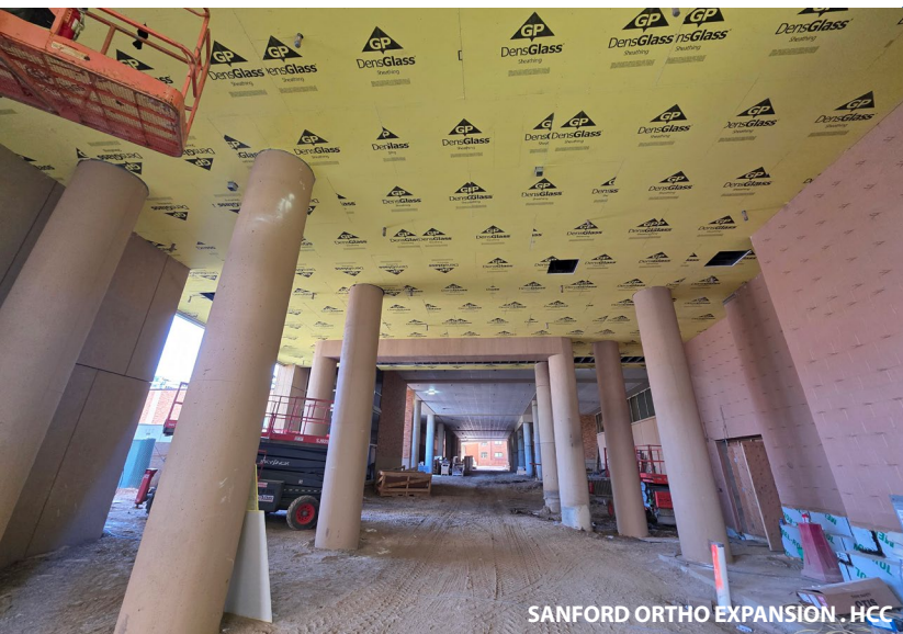
SANFORD ORTHO EXPANSION . HCC