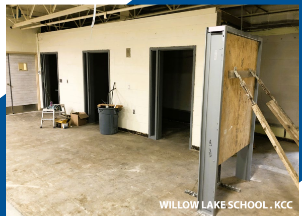
WILLOW LAKE SCHOOL . KCC