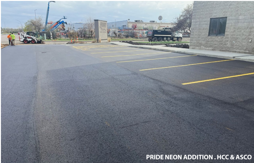
PRIDE NEON ADDITION . HCC & ASCO