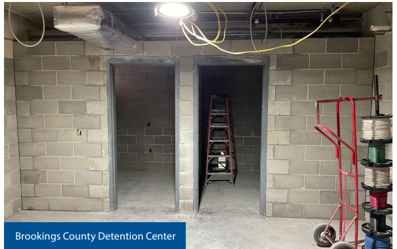
Brookings County Detention Center