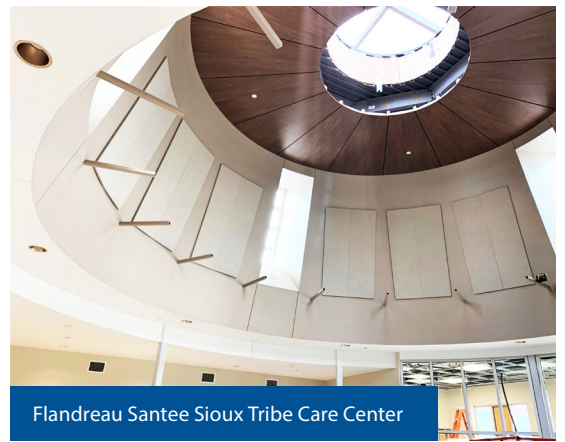
Flandreau Santee Sioux Tribe Care Center