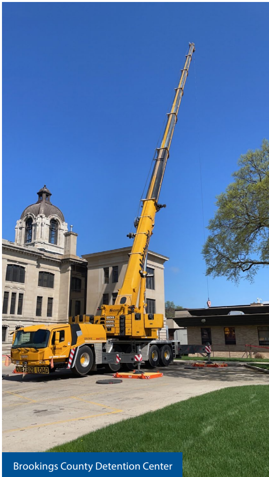
Brookings County Detention Center