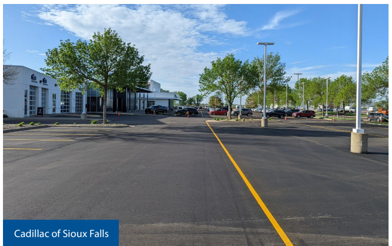
Cadillac of Sioux Falls