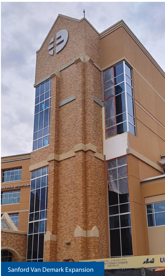
Sanford Van Demark Expansion