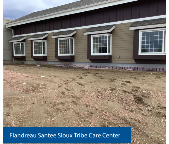
Flandreau Santee Sioux Tribe Care Center