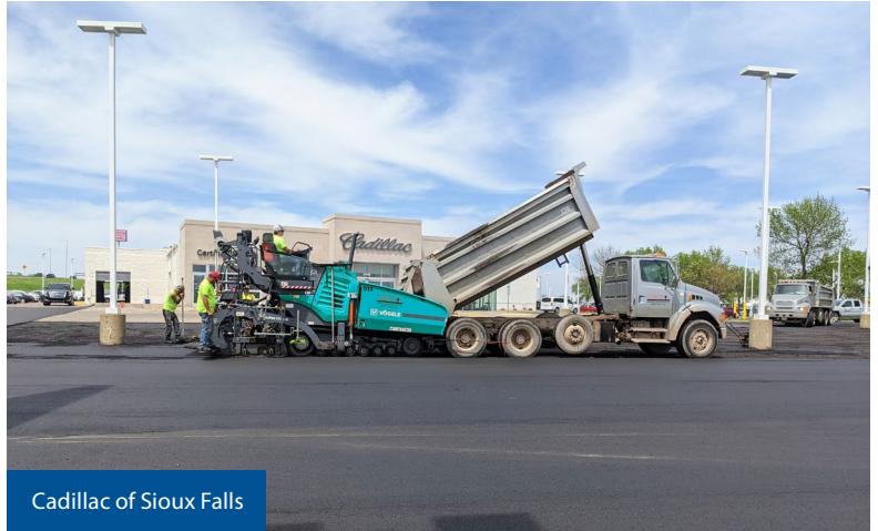
Cadillac of Sioux Falls