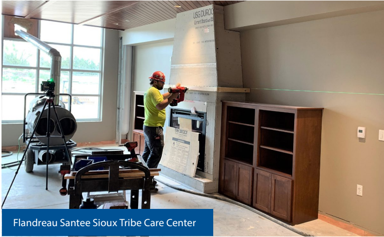
Flandreau Santee Sioux Tribe Care Center

A look at a few of our current or recently completed projects in the area.