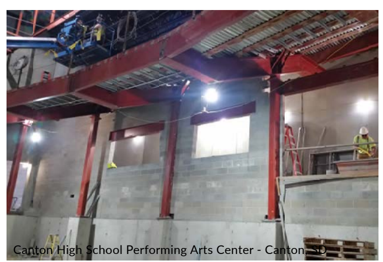
Canton High School Performing Arts Center: The crew is working on the catwalk construction.