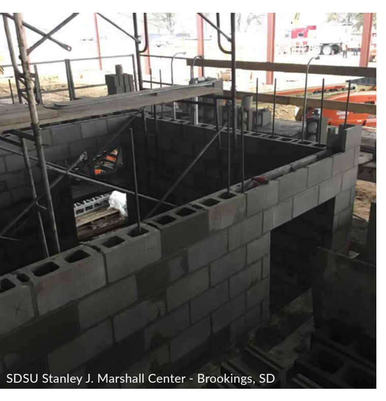
SDSU Stanley J. Marshall Center: Precast installation is ongoing, over half of it has been completed. Masonry is in progress at the stair tower. Work will begin on the center wall so we can finish out this aspect of construction. We anticipate being able to pour the penthouse slab on deck as soon as the weather allows. We will continue with the east and west slabs of the north half of the building after the penthouse is poured.