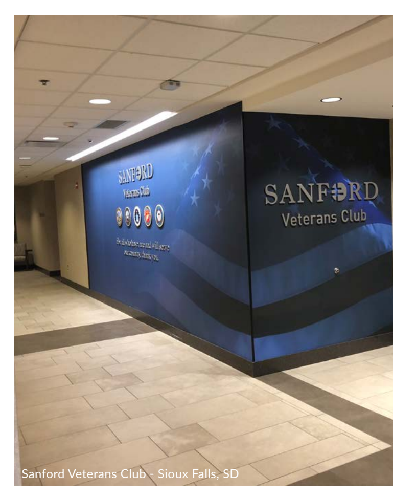
Sanford Veterans Club: JT's crew finished building the Sanford Health Veterans Club late March. The special lounge has a game table, TV, computer access and hot coffee. The doors opened April 6.