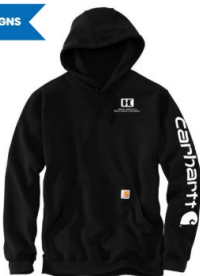
SanMar - KTK288 Carhartt * Midweight Hooded Logo... $72.00