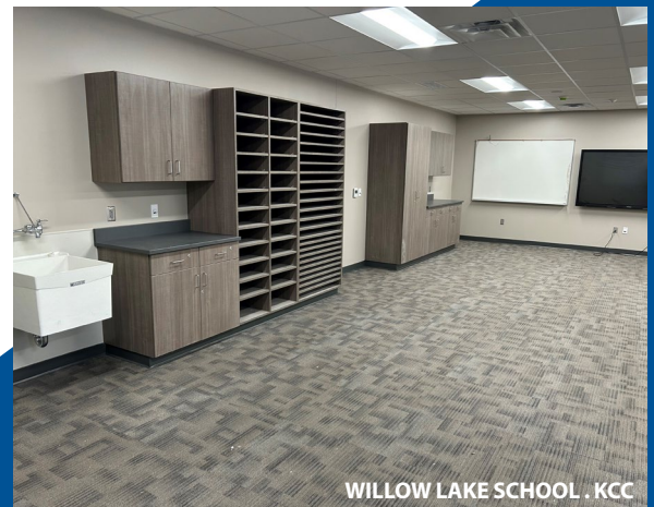
WILLOW LAKE SCHOOL . KCC