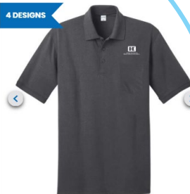
SanMar - KP55P Port & Company * Core Blend Jers... $25.50