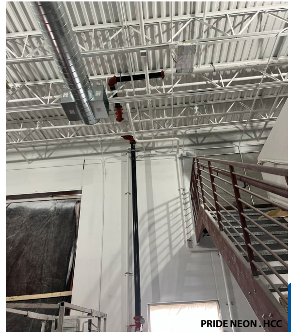
PRIDE NEON . HCC