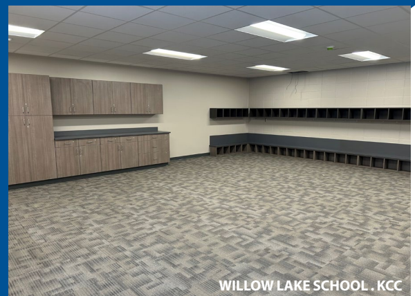
WILLOW LAKE SCHOOL . KCC

Willow Lake School: The Phase 2 remodel is nearly complete, with the music room casework installation in progress. Final clean-up will take place next, and the space will be ready for inspection and owner move-in by the end of the month. Phase 3 work will begin shortly after.