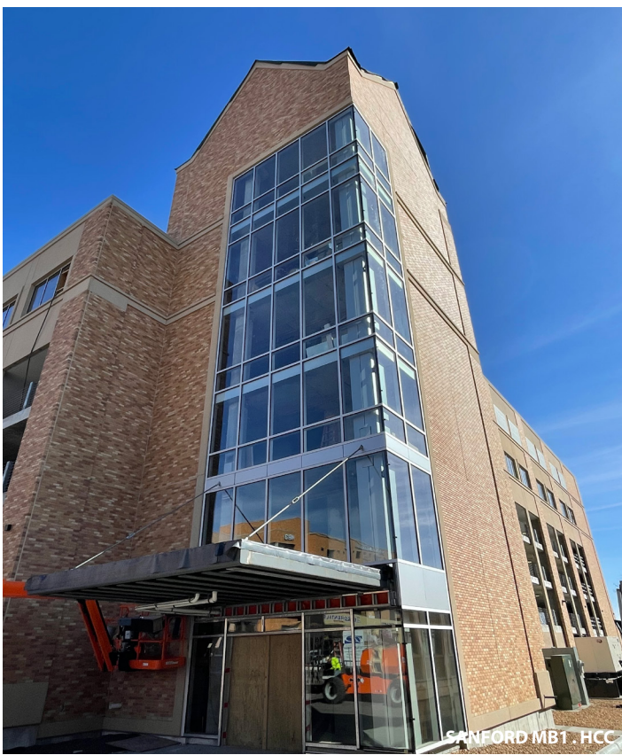
SANFORD MB1 . HCC