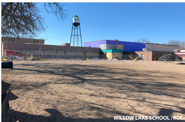
WILLOW LAKE SCHOOL . KCC

Groton Substation The building is now enclosed with spray foam-insulated walls and the concrete floors are poured. Roofing has begun with metal installation and gutturing. Masons will start brickwork soon, and KCC is set to work on interior plywood sheathing, drywall and FRP shortly.