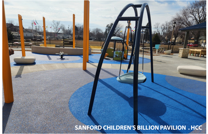
SANFORD CHILDREN'S BILLION PAVILION . HCC