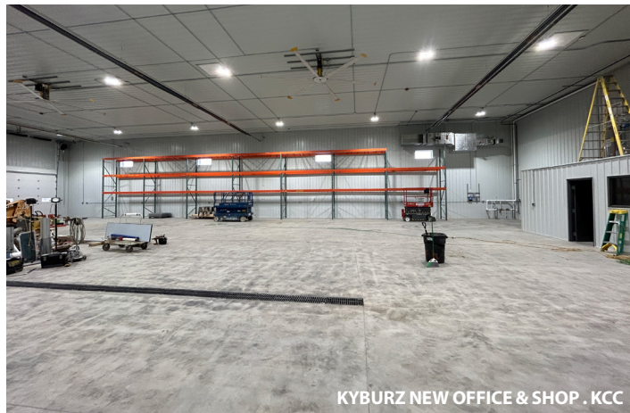
KYBURZ NEW OFFICE & SHOP . KCC

Kyburz New Office & Shop We've successfully transitioned into the new offices, with the pallet racking now installed in the shop. Following the completion of the electrical work by the electricians in a couple of weeks; we'll commence the relocation of equipment and tools.