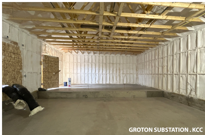
GROTON SUBSTATION . KCC

Groton Substation The building is now enclosed with spray foam-insulated walls and the concrete floors are poured. Roofing has begun with metal installation and gutturing. Masons will start brickwork soon, and KCC is set to work on interior plywood sheathing, drywall and FRP shortly.