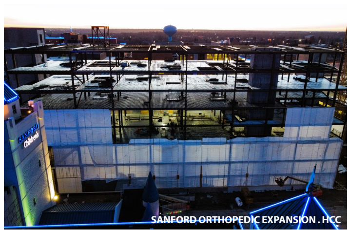
SANFORD ORTHOPEDIC EXPANSION . HCC