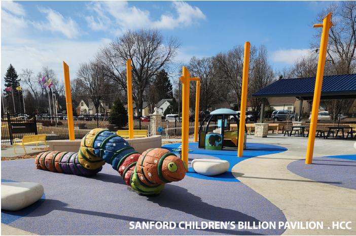
SANFORD CHILDREN'S BILLION PAVILION . HCC