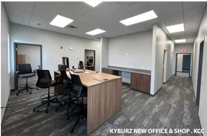
KYBURZ NEW OFFICE & SHOP . KCC