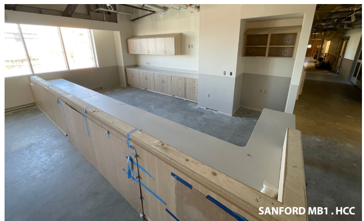
SANFORD MB1 . HCC