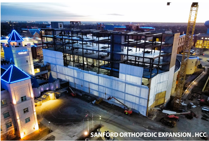
SANFORD ORTHOPEDIC EXPANSION . HCC