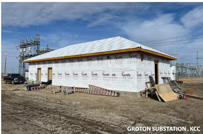
GROTON SUBSTATION . KCC

Kyburz New Office & Shop We've successfully transitioned into the new offices, with the pallet racking now installed in the shop. Following the completion of the electrical work by the electricians in a couple of weeks; we'll commence the relocation of equipment and tools.