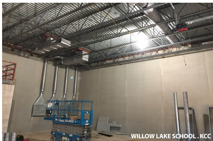
WILLOW LAKE SCHOOL . KCC

Willow Lake School Roofing installation is finished, with nearly all floors poured. Brickwork is nearing completion within the next 1-2 weeks. Progress continues with framing and MEP rough-ins, and drywall installation will begin next week.