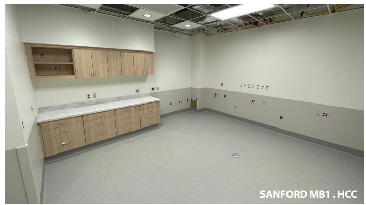
SANFORD MB1 . HCC