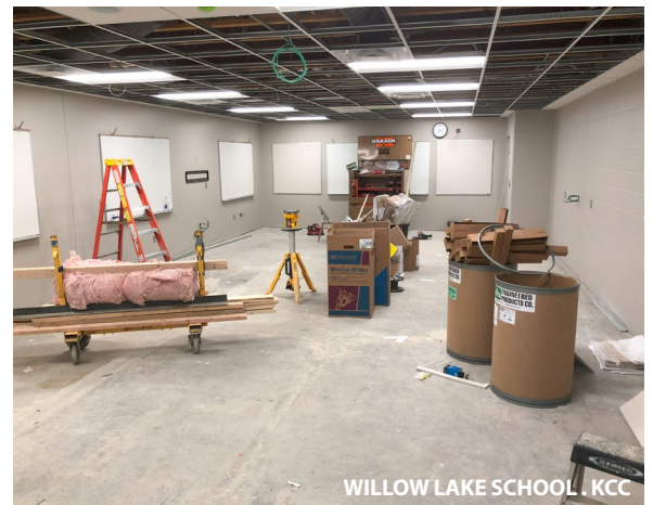
WILLOW LAKE SCHOOL . KCC