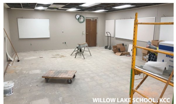
WILLOW LAKE SCHOOL . KCC