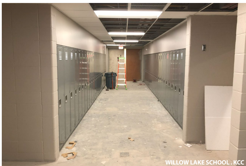
WILLOW LAKE SCHOOL . KCC

Willow Lake School: Phase 2 of the remodel is progressing smoothly. Painting is finished, the ceiling grid and light fixtures are installed, and casework installation is set to begin in the next couple of weeks. Following that, flooring will be installed, along with music and instrument storage casework.