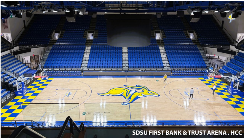
SDSU FIRST BANK & TRUST ARENA . HCC

We're excited to see this state-of-the-art facility in action and how it continues to serve the SDSU community!