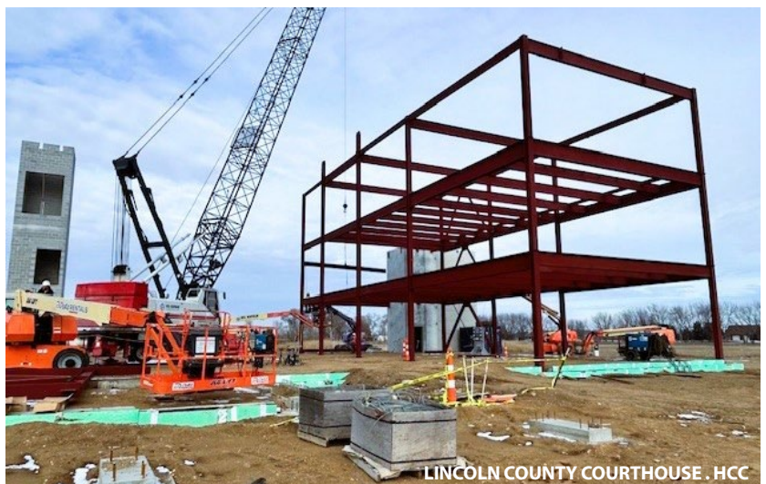
LINCOLN COUNTY COURTHOUSE . HCC