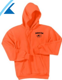
SanMar - PC90HT Port & Company® Tall Essential Fle... $36.00