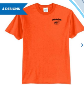
SanMar - PC55 Port & Company® - Core Blend Tee. $11.50