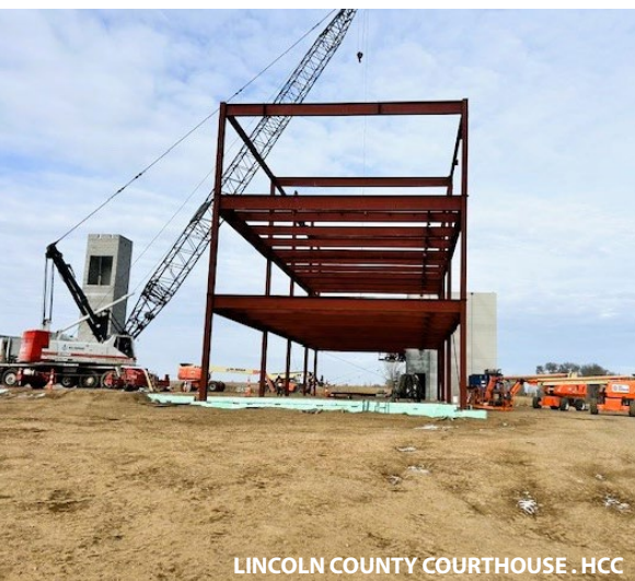
LINCOLN COUNTY COURTHOUSE . HCC