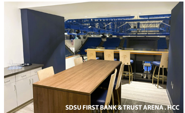
SDSU FIRST BANK & TRUST ARENA . HCC