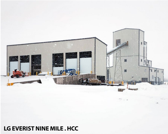
LG EVERIST NINE MILE . HCC