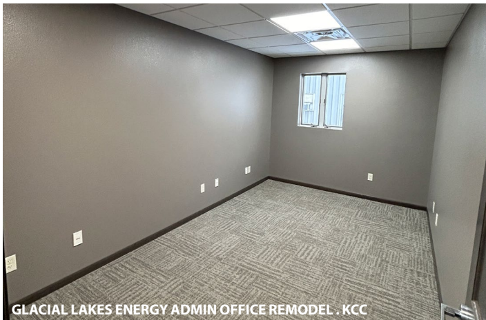
GLACIAL LAKES ENERGY ADMIN OFFICE REMODEL . KCC

Groton Substation The footing and foundation work are finished, and we've begun the wall framing and sheathing. In a few weeks, we'll be moving on to the roof trusses and sheathing. Our goal is to enclose and heat the building as quickly as possible, allowing us to pour the floors and start the interior work.