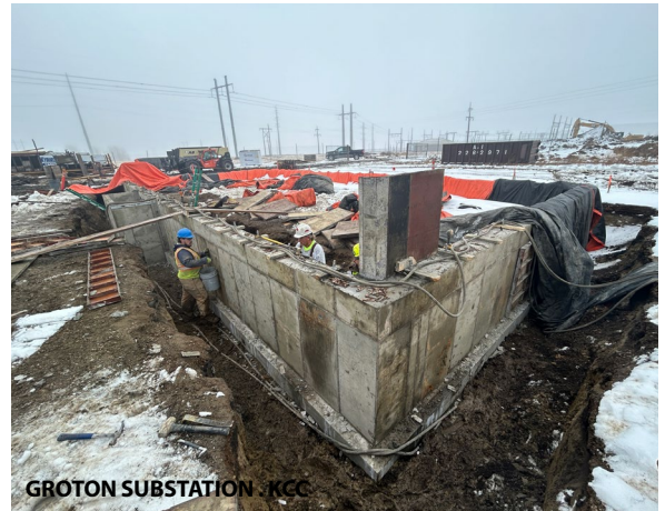
GROTON SUBSTATION . KCC

Groton Substation The footing and foundation work are finished, and we've begun the wall framing and sheathing. In a few weeks, we'll be moving on to the roof trusses and sheathing. Our goal is to enclose and heat the building as quickly as possible, allowing us to pour the floors and start the interior work.