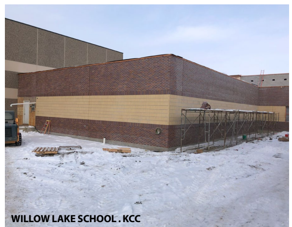
WILLOW LAKE SCHOOL . KCC

Willow Lake School The installation of roofing is in progress, with concrete floors scheduled to follow. Brickwork has been completed on the south side and is currently underway on the east side. This allows for the progression of framing and MEP rough-ins in the locker rooms and shop.