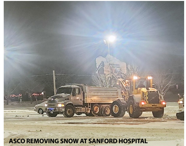
ASCO REMOVING SNOW AT SANFORD HOSPITAL