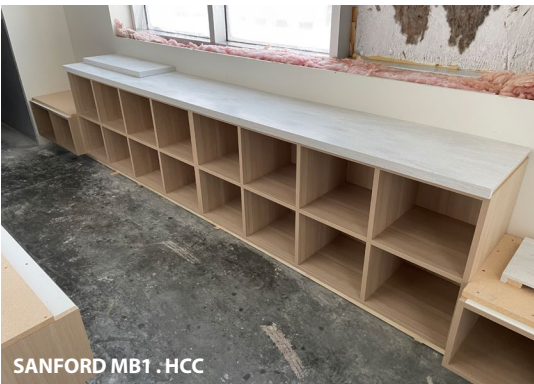
SANFORD MB1 . HCC