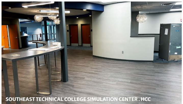
SOUTHEAST TECHNICAL COLLEGE SIMULATION CENTER . HCC