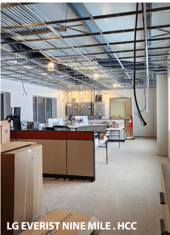
LG EVERIST NINE MILE . HCC