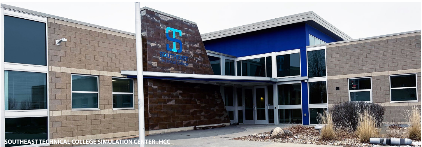
SOUTHEAST TECHNICAL COLLEGE SIMULATION CENTER . HCC