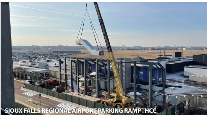
SIoux FALLS REGIONAL AIRPORT PARKING RAMP . HCC