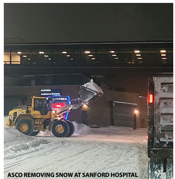
ASCO REMOVING SNOW AT SANFORD HOSPITAL