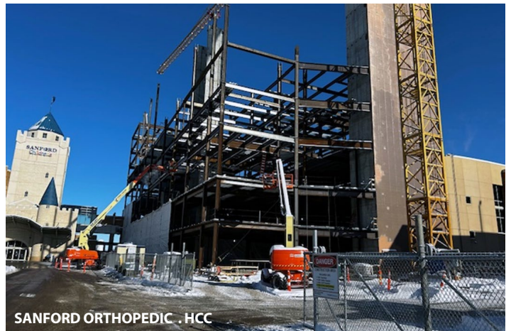
SANFORD ORTHOPEDIC . HCC