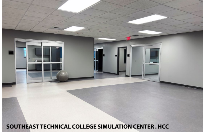
SOUTHEAST TECHNICAL COLLEGE SIMULATION CENTER . HCC