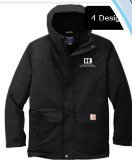
4 Designs SanMar - CT105533 Carhartt® Super Dux™ Ins' Hooded Coat $170.50

Check out the new monthly webstore for HCC/KCC/ASCO/Dakota Seal merch! This store will run the 1st-15th of every month. All orders will be processed after the store closes. Orders will be available approximately four weeks from the store close date. You will receive a notification when your order has arrived. All orders will be available for pickup at the Henry Carlson Office.