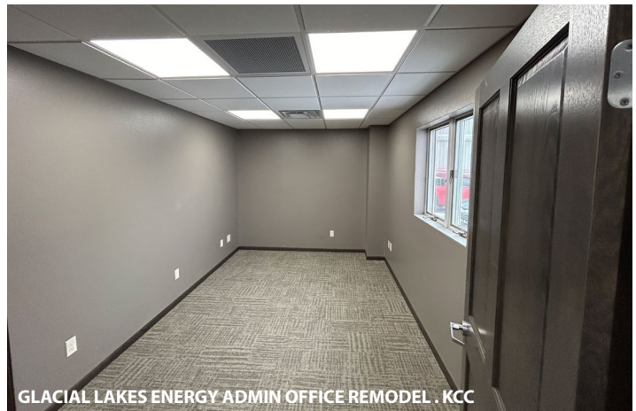
GLACIAL LAKES ENERGY ADMIN OFFICE REMODEL . KCC

Glacial Lakes Energy Admin Office Remodel We're currently in the final stages of the construction process, with the punchlist being addressed. The owners are extremely pleased and filled with excitement as they prepare to move into their new space.