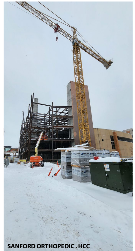
SANFORD ORTHOPEDIC . HCC