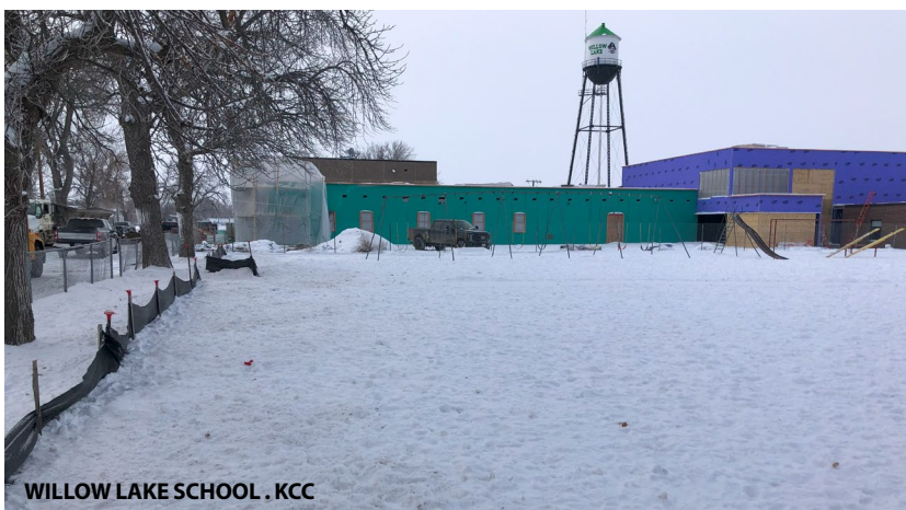
WILLOW LAKE SCHOOL . KCC

Glacial Lakes Energy Admin Office Remodel We're currently in the final stages of the construction process, with the punchlist being addressed. The owners are extremely pleased and filled with excitement as they prepare to move into their new space.