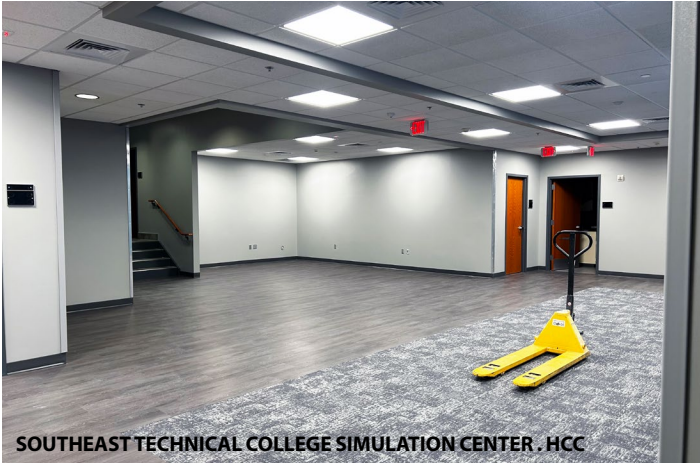
SOUTHEAST TECHNICAL COLLEGE SIMULATION CENTER . HCC