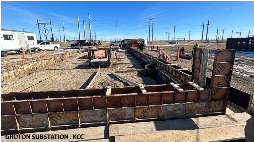
GROTON SUBSTATION . KCC