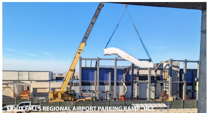
SIoux FALLS REGIONAL AIRPORT PARKING RAMP . HCC