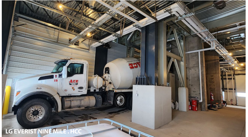
LG EVERIST NINE MILE . HCC