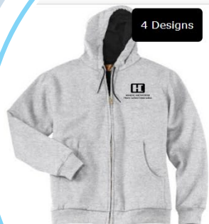
4 Designs SanMar - CS620 CornerStone® - Heavyweight Zip Hooded Sweatshirt with Thermal Lining. $61.00