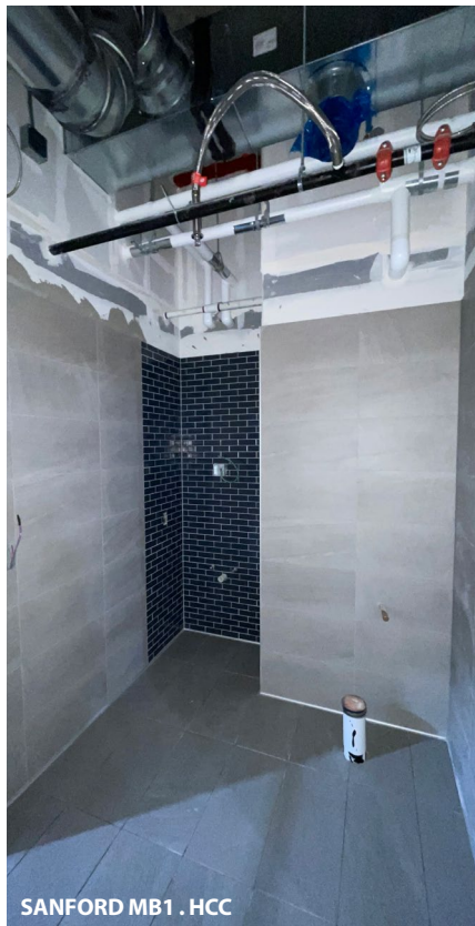
SANFORD MB1 . HCC