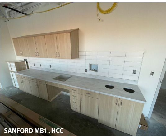
SANFORD MB1 . HCC