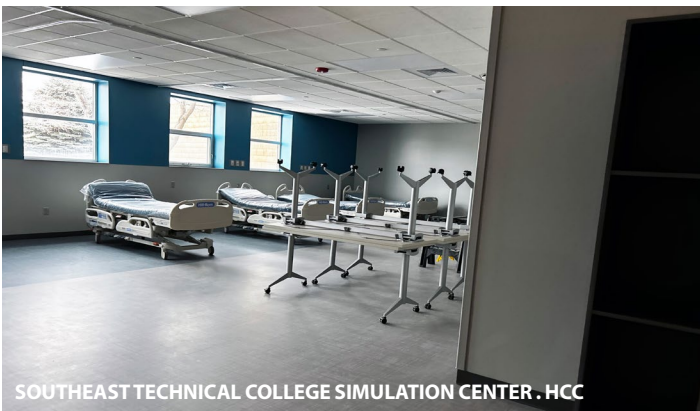
SOUTHEAST TECHNICAL COLLEGE SIMULATION CENTER . HCC