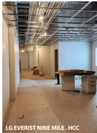
LG EVERIST NINE MILE . HCC