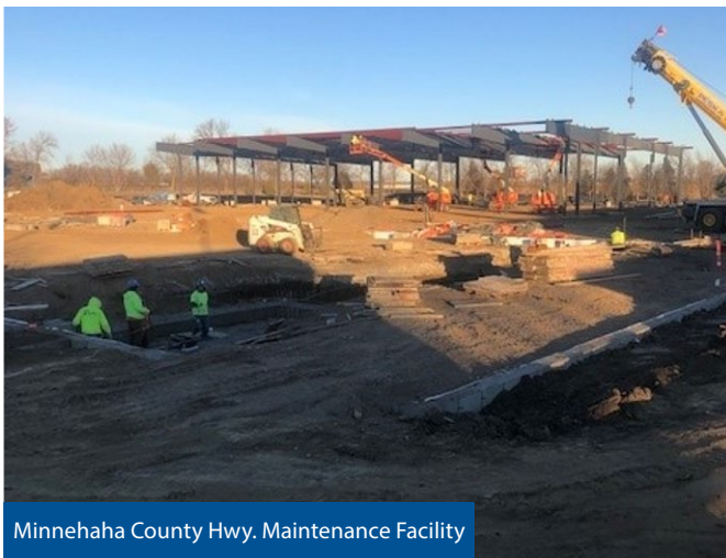
Minnehaha County Hwy. Maintenance Facility