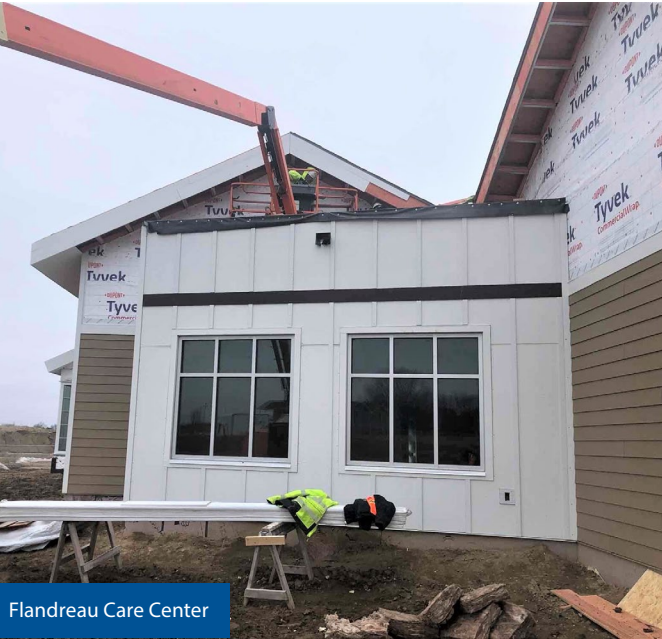
Flandreau Care Center