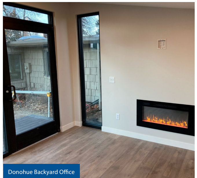
Donohue Backyard Office

To learn more about our current projects, visit our website: www.henrycarlson.com .