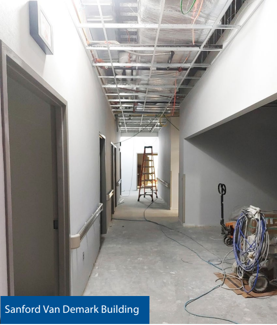
Sanford Van Demark Building