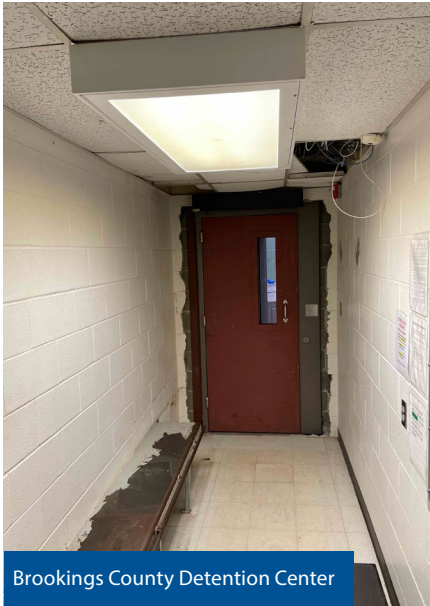
Brookings County Detention Center

A look at a few of our current or recently completed projects in the area.