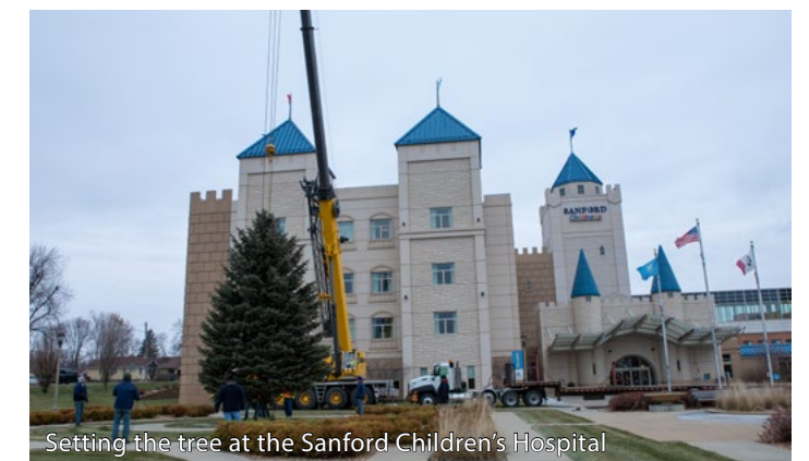
Setting the tree at the Sanford Children's Hospital