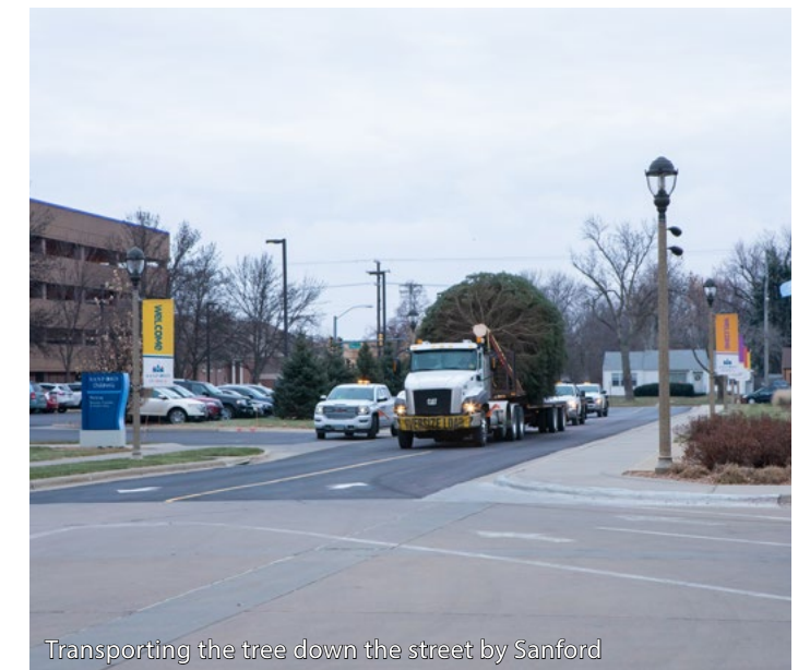
Transporting the tree down the street by Sanford

Sanford Children's Hospital held their second annual Christmas Tree lighting ceremony November 29th. Henry Carlson Construction sponsored the event, which benefits the patients at the Children's Hospital.