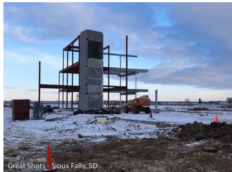
Great Shots - Sioux Falls, SD