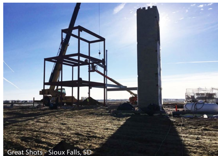
Great Shots - Sioux Falls, SD

Valley Springs Rest Area: Foundations are expected to be complete by January 25 with the building shell starting in early February.