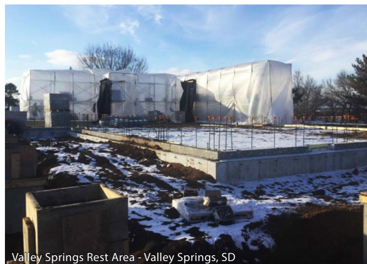
Valley Springs Rest Area - Valley Springs, SD