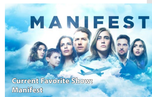
Current Favorite Show: Manifest