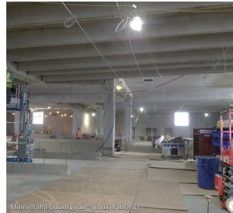
Minnehaha County Jail - Sioux Falls, SD