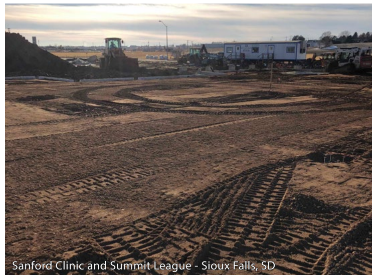
Sanford Clinic and Summit League - Sioux Falls, SD