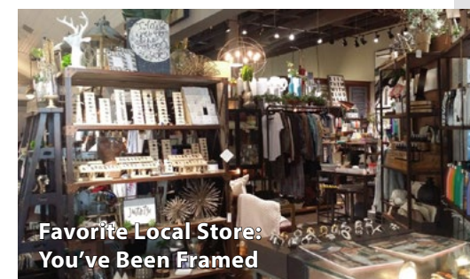
Favorite Local Store: You've Been Framed