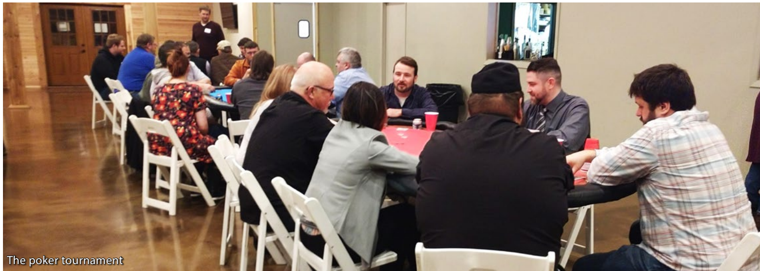
The poker tournament