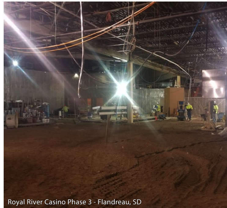
Royal River Casino Phase 3 - Flandreau, SD

Minnehaha County Jail Sioux Falls, SD June 2020