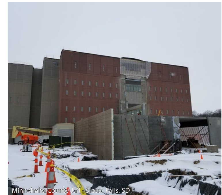
Minnehaha County Jail - Sioux Falls, SD