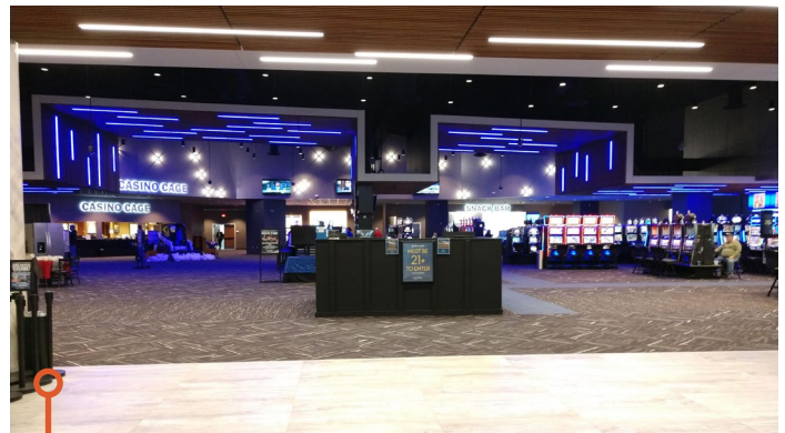
Royal River Casino & Hotel . Flandreau, SD