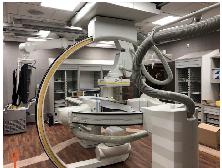
Sanford Health BI/PLANE Imaging . Sioux Falls, SD