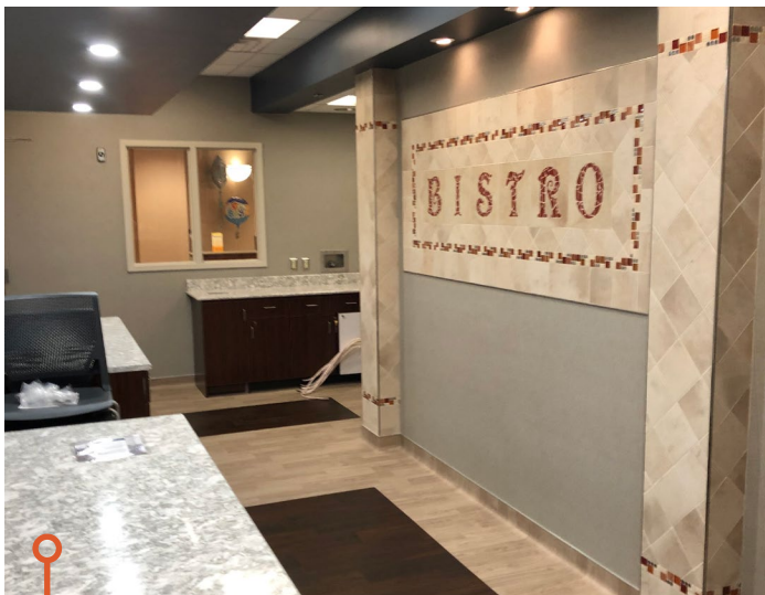
Sanford Health Bistro Remodel at Labor and Delivery in MB3 . Sioux Falls, SD