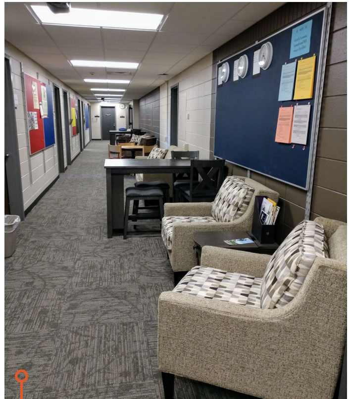
Augustana University Humanities Ph. 2 . Sioux Falls, SD