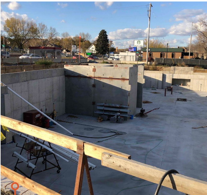
First PREMIER Bank . Sioux Falls, SD