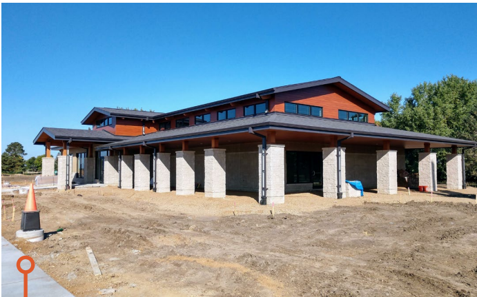
Valley Springs Rest Area and POE . Valley Springs, SD