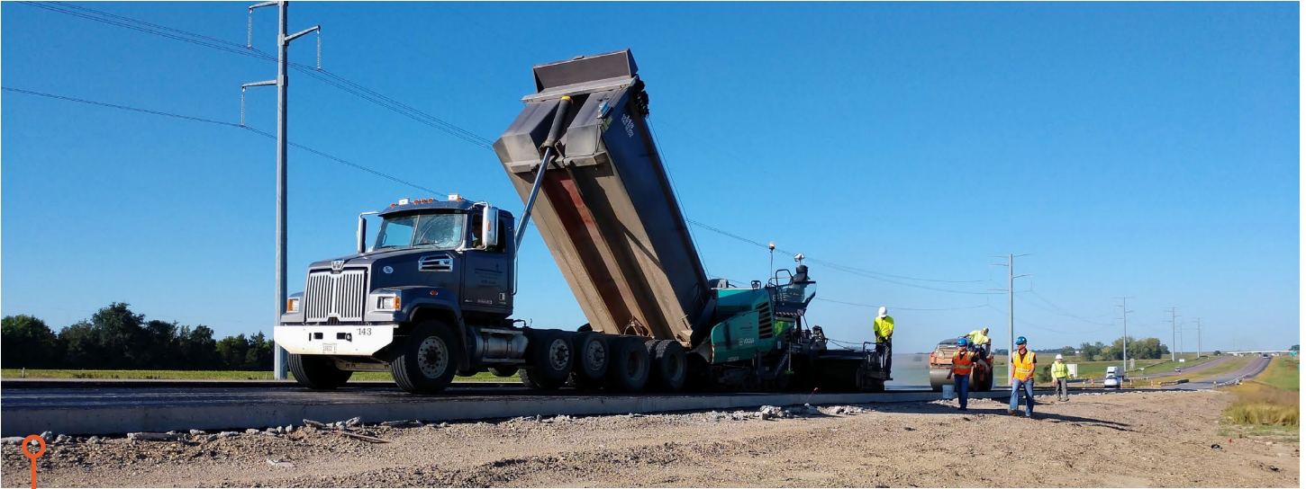
Valley Springs Rest Area and Port of Entry . Valley Springs, SD