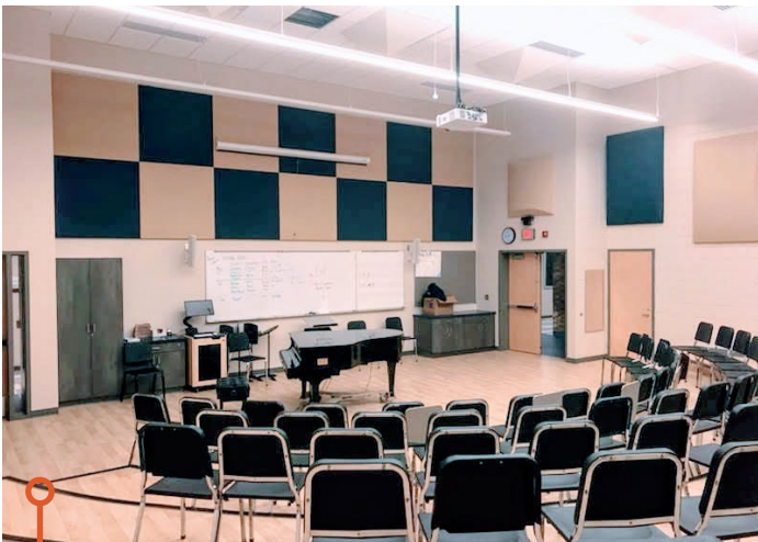
Augustana University Humanities Ph. 2 . Sioux Falls, SD