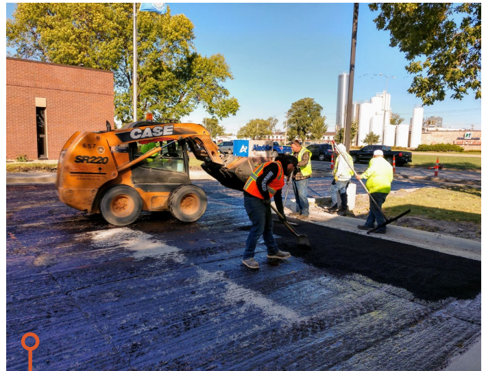
Aladdin Companies Parking Lot . Sioux Falls, SD