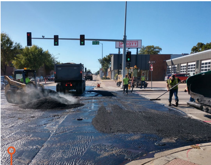
Minnesota Avenue . Sioux Falls, SD