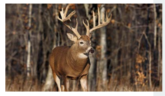
Perfect Day: Deer Hunting, Pool and Ice Fishing