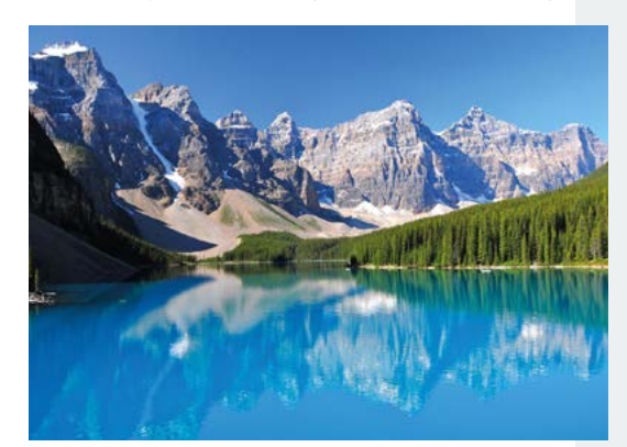
Best Vacation: Alaska