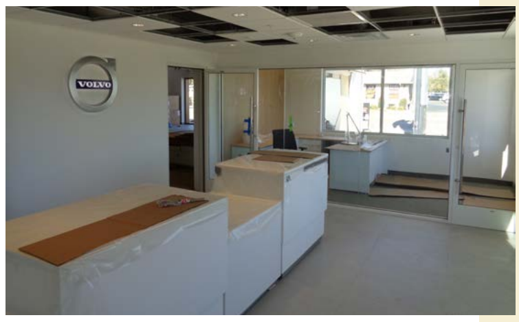
Graham Volvo Dealership Renovation - Sioux Falls, SD