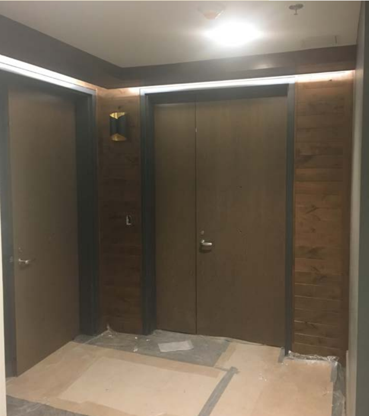
Washington Square - Sioux Falls, SD