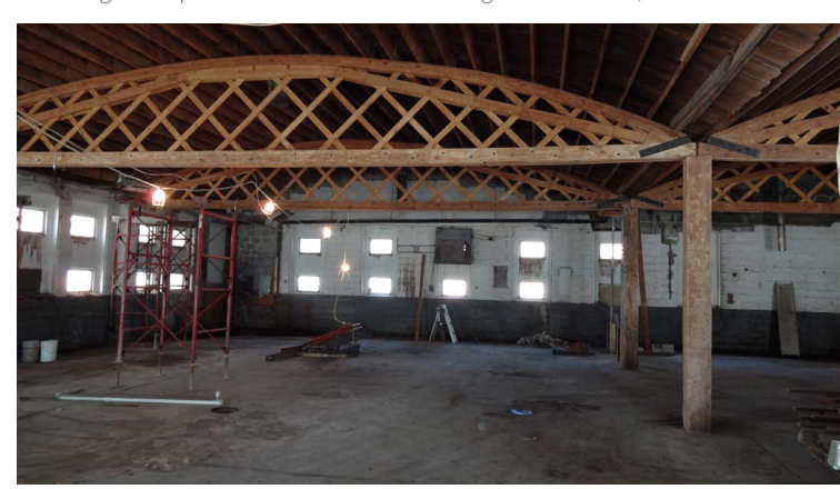
Nash-Auburn Building - Sioux Falls, SD