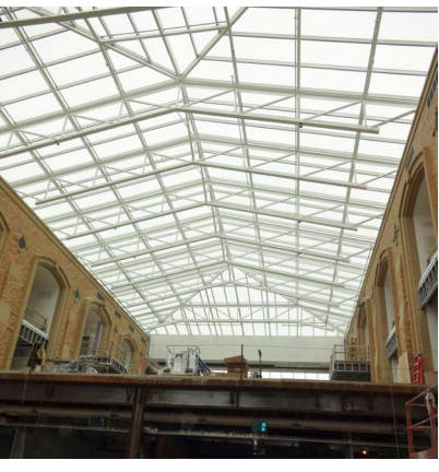
Sanford Imagenetics - Sioux Falls, SD

Canton High School Performing Arts Center -Canton, SD August 2018