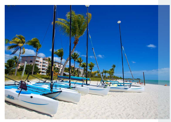
Best Place Traveled: Key West, FL