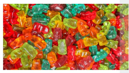
Cant Resist: Gummy Bears