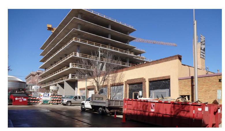
Washington Square/Nash-Auburn Building - Sioux Falls, SD