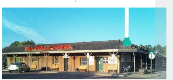
Favorite Local Restaurant: Tea Steakhouse