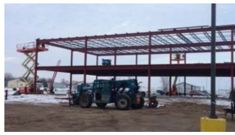
Flandreau Royal River Casino - Flandreau, SD